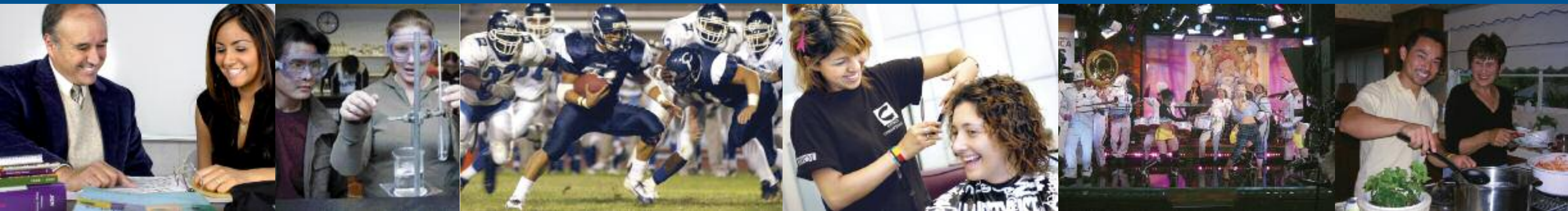
Many students stay with American families in the homestay program.